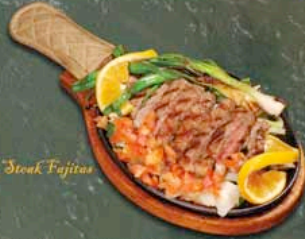
N.Y. Steak Fajitas

NEW YORK STEAK FAJITAS ..$16.95 CHICKEN FAJITAS ..$14.75 SHRIMP FAJITAS ..$15.75 FAJITAS DEL MAR ..$19.75 (Scallops, crab meat, shrimp) LOBSTER MEAT FAJITAS ..$20.75 FAJITAS MIXTAS N.Y. ..$28.50 (Steak, chicken and shrimp) VEGGIE FAJITAS ..$12.95